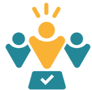
Everyone is a leader

Our Civica Leadership Forum agreed, and have seen first-hand, that almost everyone working in the public sector starts with a determined sense of ‘public service’. They are passionate about making a positive difference to the society in which they live and firmly believe they can be the ‘agent of change’ to make this happen. But often frustration sets in. So, what is influencing this slow-down of positive change? Our Leadership Forum agreed that there needs to be a radical change in not only leadership style, but also the organisational structure and culture across the sector.