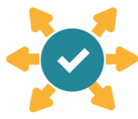
Light touch rules

The public sector has spent decades working in professional silos. So, how do you break down the barriers and create teams that work together across agencies? We need to encourage the rebels to take action, to drive ongoing learning and improvements, for everyone to see that their role is constantly evolving.